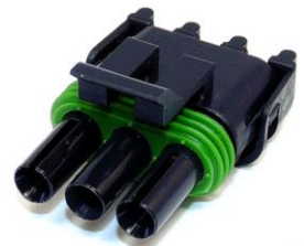
Weather Pack Connector 3 Pins Female

If one of the tests is not correct, Replace the Regulator