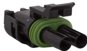
Weather Pack Connector 2 Pins Female